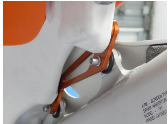
Both Lower brackets are completely identical. Other side will face down.