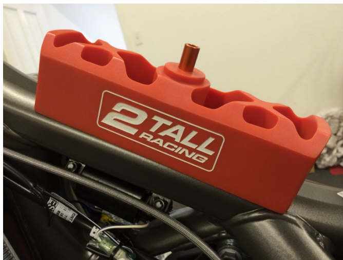
Pictured shows Stage II Riser but same concept for Stage I Riser

DISCLAIMER: All products manufactured and/or distributed by 2Tall Racing llc are a) intended for use on stock vehicles specific to the U.S. market and b) for closed course use only unless otherwise stated.